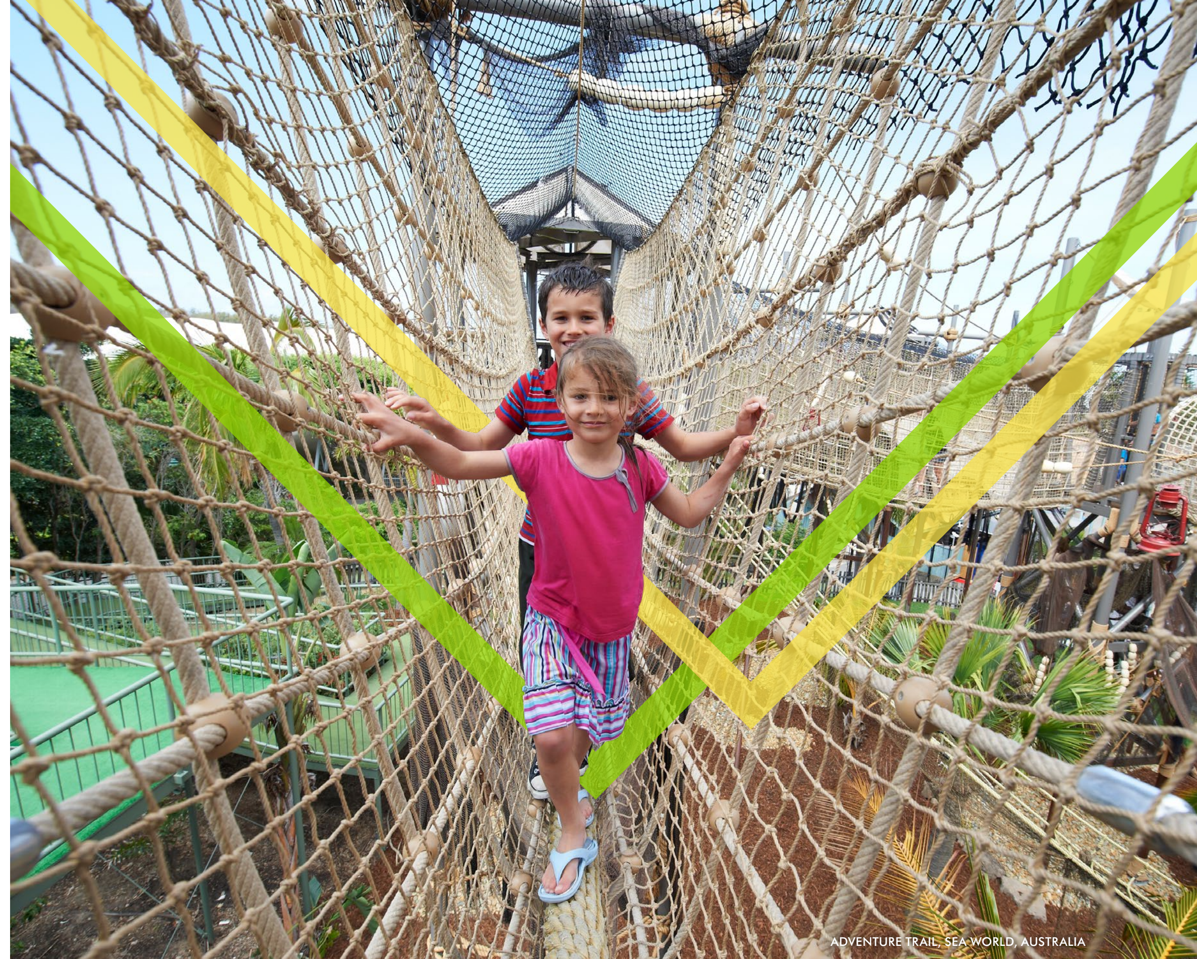
ADVENTURE TRAIL, SEA WORLD, AUSTRALIA