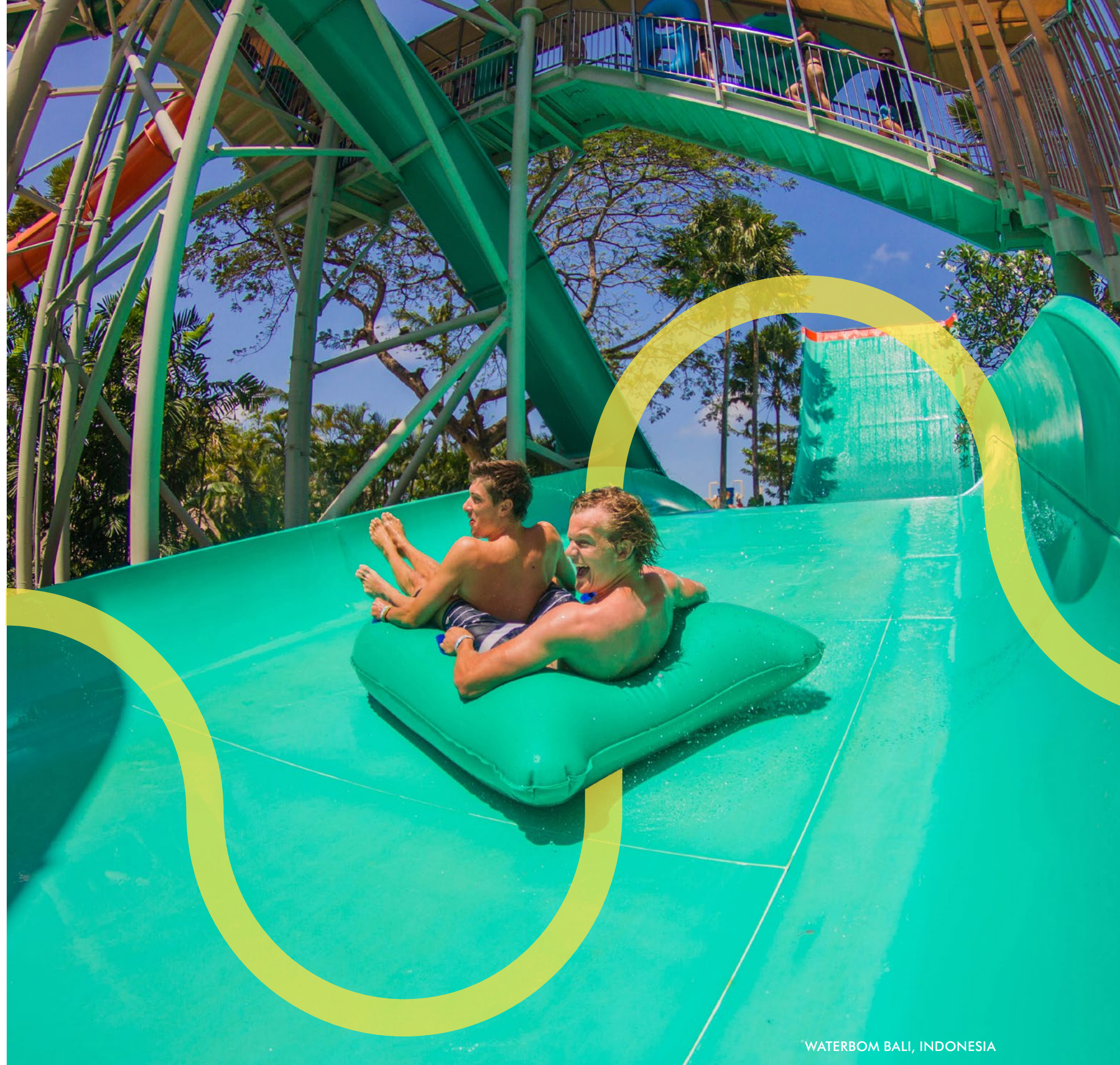
WATERBOM BALI, INDONESIA