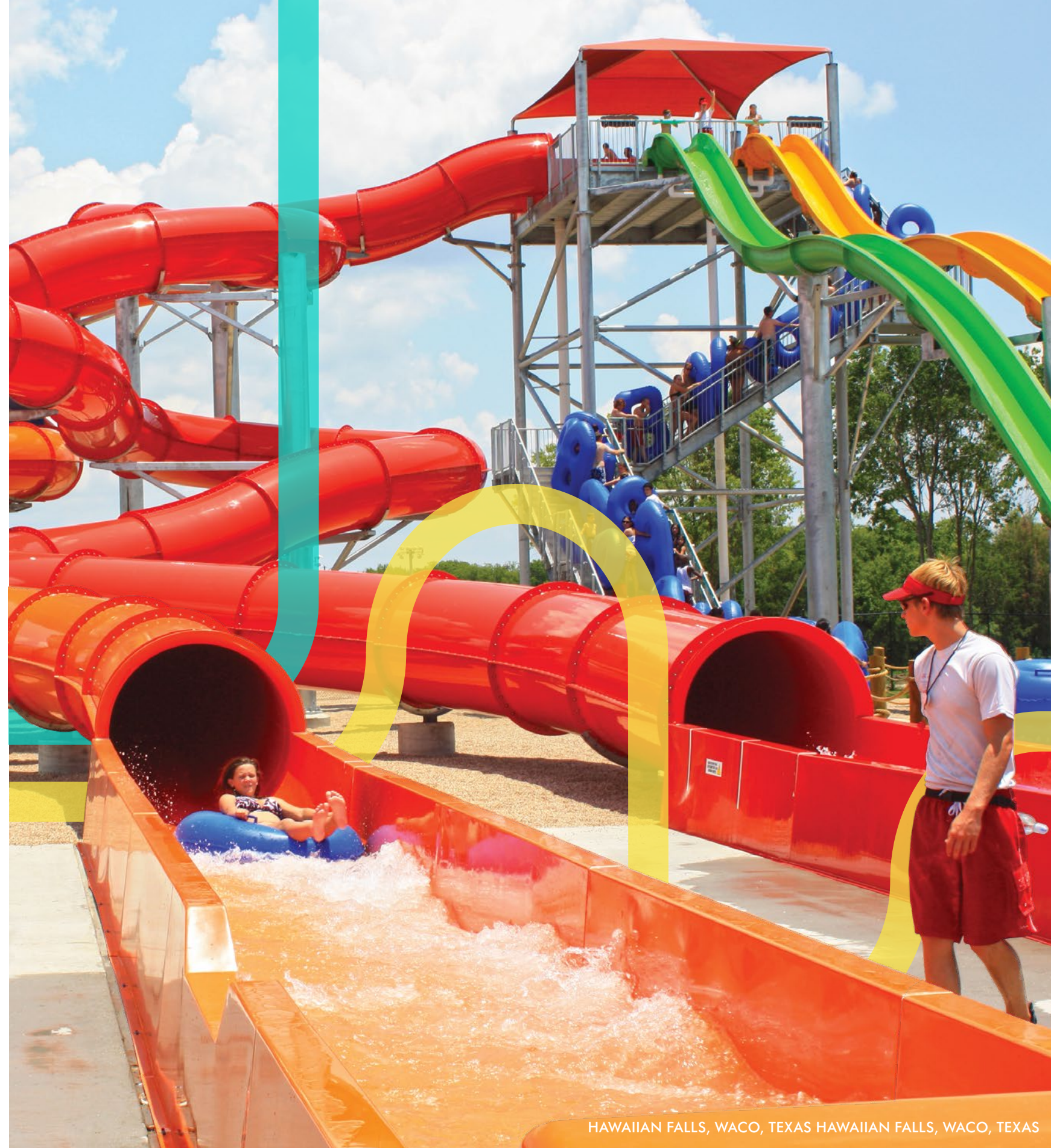
HAWAIIAN FALLS, WACO, TEXAS HAWAIIAN FALLS, WACO, TEXAS

Regular maintenance is worth the investment because it keeps large replacement costs down by extending the life of your product.