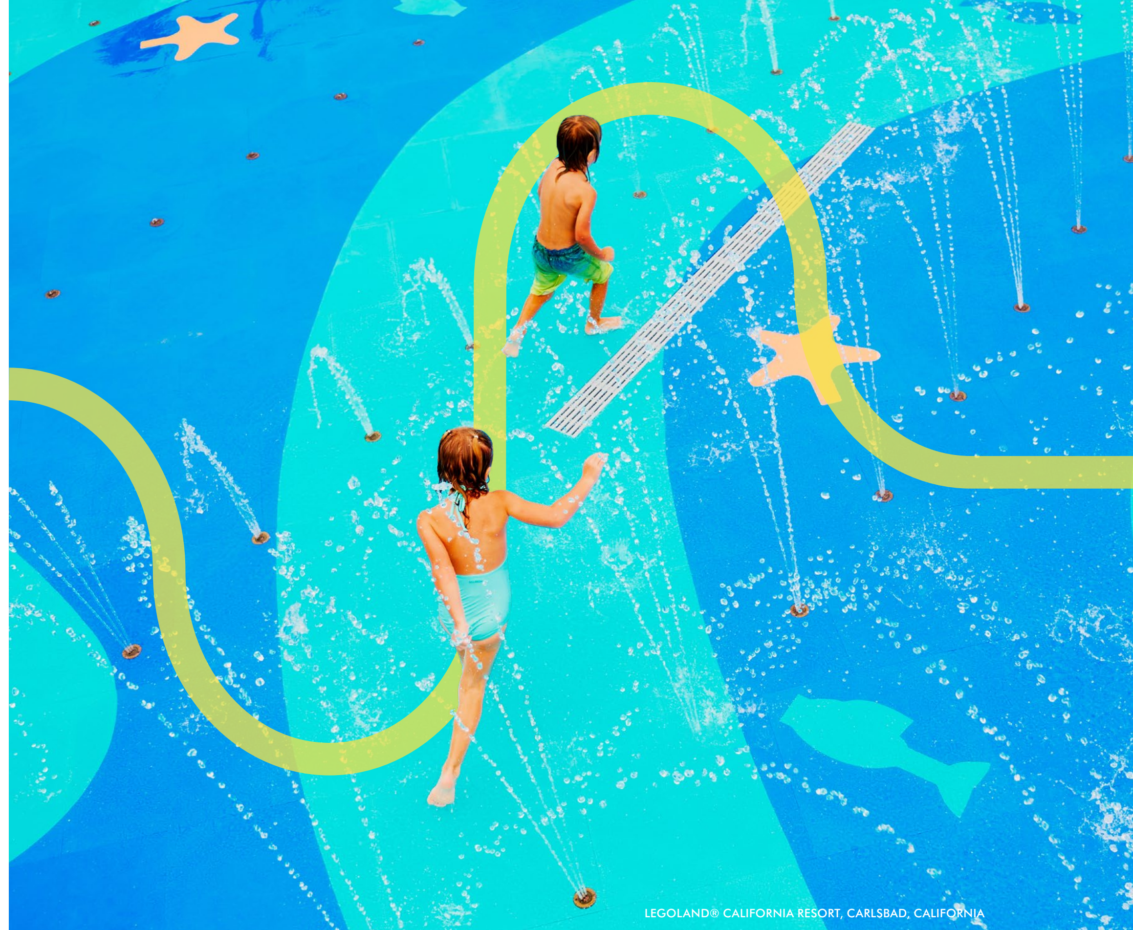
LEGOLAND® CALIFORNIA RESORT, CARLSBAD, CALIFORNIA

Slips and falls are the most common waterpark injury and Life Floor dramatically reduces these incidents. Our maintenance department can help you retrofit Life Floor into spots you know you have trouble with slips and falls and install it to help take this worry away. Plus, the bright colors and designs possible with Life Floors can help improve the visual impact of your park.